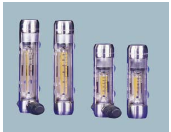
Glass Tube Purge Meters with Stainless Steel Frame