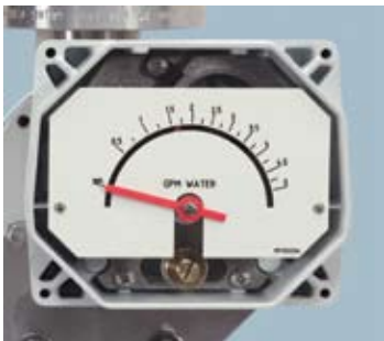
Integral flow switch (shown with cover removed)