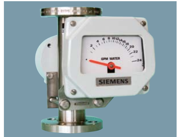
Armored Flowmeter with 150 lb. RF flanged connections

The standard readout is in a magnetically coupled indicator unit. Optional 4-20 mA transmitter and alarm switches are also available.