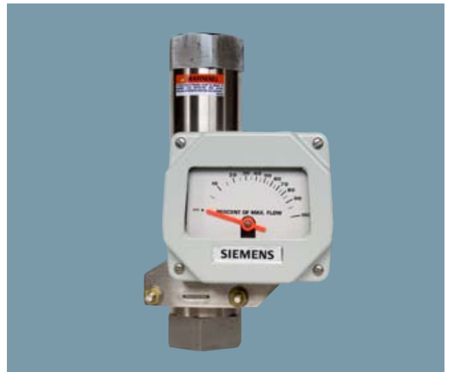
Armored flowmeter with NPT connections

Note: To determine Fe for specific gravities not shown in Table F, use liquid-specific gravity correction equation.