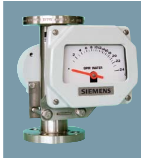
Armored Flowmeter with NPT connections and optional external flow switch

Dimensions – For complete dimensions, please refer to literature: WT.550.200.100.UA.CN and WT.550.200.108.UA.CN