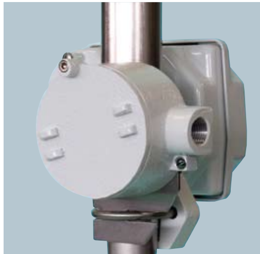
Electronic Flow Transmitter mounted on meter body

Dimensions – For complete dimensions, please refer to literature: WT.550.200.106.UA.CN and WT.550.200.114.UA.CN