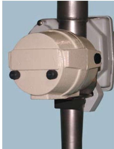
External general purpose flow switch mounted on meter body