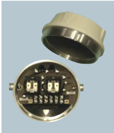
Flow switch with switches and relays