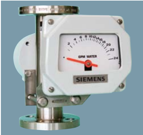
Armored Flowmeter with 150 lb. RF flanged connections

Materials of Construction – Metering tube, end fittings, and orifice are 316 stainless steel. For liquid service, float is 316 stainless with 301 stainless steel guide; for gas, polypropylene or optional TFE body with 301 stainless steel guide. Alarm and indicator housings are cast aluminum finished with special baked-on vinyl melamine enamel for corrosion resistance. Write for WT.500.001.000.UA.CG, which is a detailed listing of meter compatibility with a wide range of fluids.